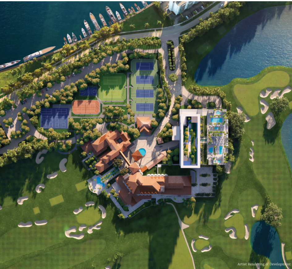
Artist Rendering of Development